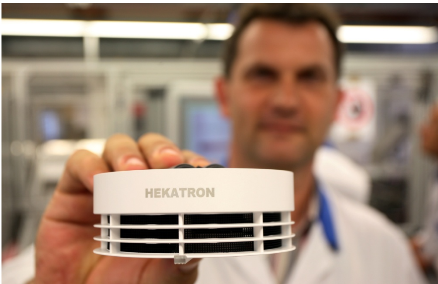
caption: Genius smoke detector from Hekatron Download file: http://www.pr-x.de/uploadfiles/pictures//0710_125940_165_bild_02.jpg